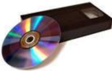
GONE DVD'S and Video Tapes