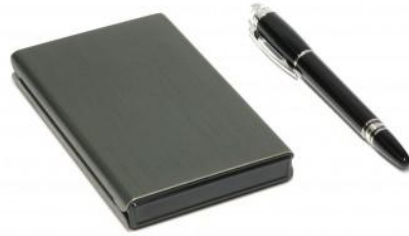
Replaced with hard and pen drives

* Pen is for size comparison only and is not included